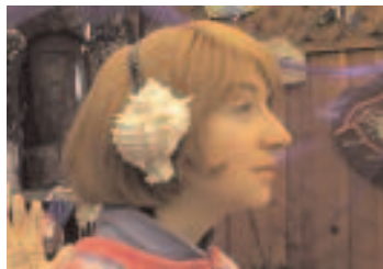
Shana Moulton Whispering Pines #5 , 2006